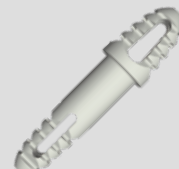
TICTAC Ø3,1 - 0° ref. 268 614