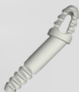
TICTAC Ø2,5 - 20° ref. 270 392