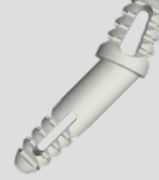
TICTAC Ø3,1 - 20° ref. 270 394