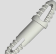
TICTAC Ø3,4 - 10° ref. 268 617