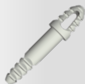
TICTAC Ø2,5 - 0° ref. 270 390

TOE INTERPHALANGEAL CAGE TOE ARTHRODESIS CAGE