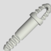
TICTAC Ø2,8 - 0° ref. 268 612