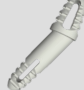
TICTAC Ø3,4 - 20° ref. 270 395