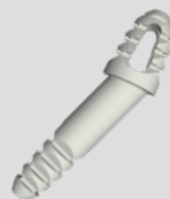
TICTAC Ø2,8 - 20° ref. 270 393